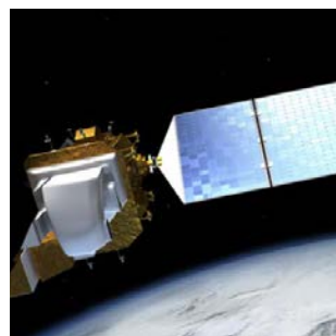
1975 - Start operating in the digital imaging domain for remote "sensing" applications from Landsat satellites (NASA/Telespazio)