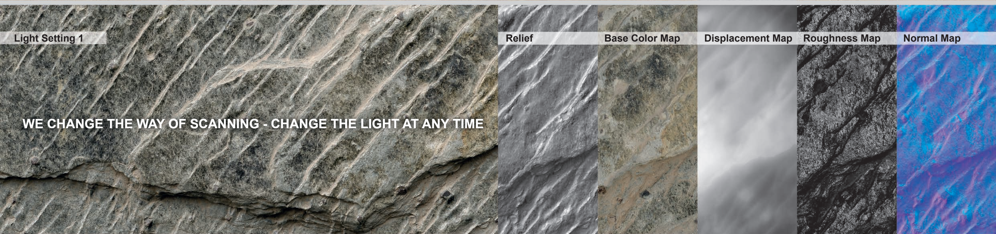
Light Setting 1