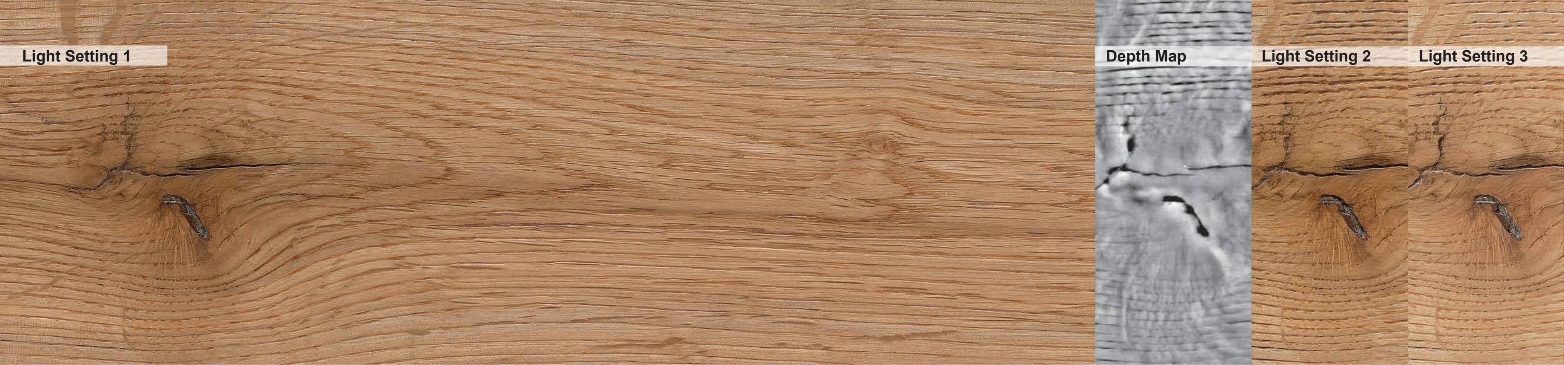
Light Setting 1