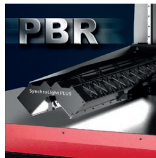
SynchroLight PLUS & PBR

METIS scanners can be found almost everywhere in the world, with customers ranging from the most important decor industries to designers and other creative people. METIS Headquarter is in Rome, Italy. Our main manufacturing center is located in Tuscany.