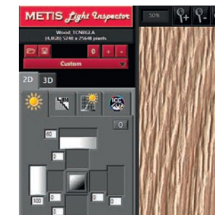
Part of the user interface

Since 2014, METIS scanners quickly provide infinite combinations of light, 3D data, gloss, etc., in a completely automated way and without the need for an expert user. Moreover, Color and 3D information are available almost at the same time and match at pixel level. Nowadays, the Photometric Stereo technique is the most desirable and successful way to generate 3D and embossing data making METIS scanners the preferred choice for decor industries and creatives.