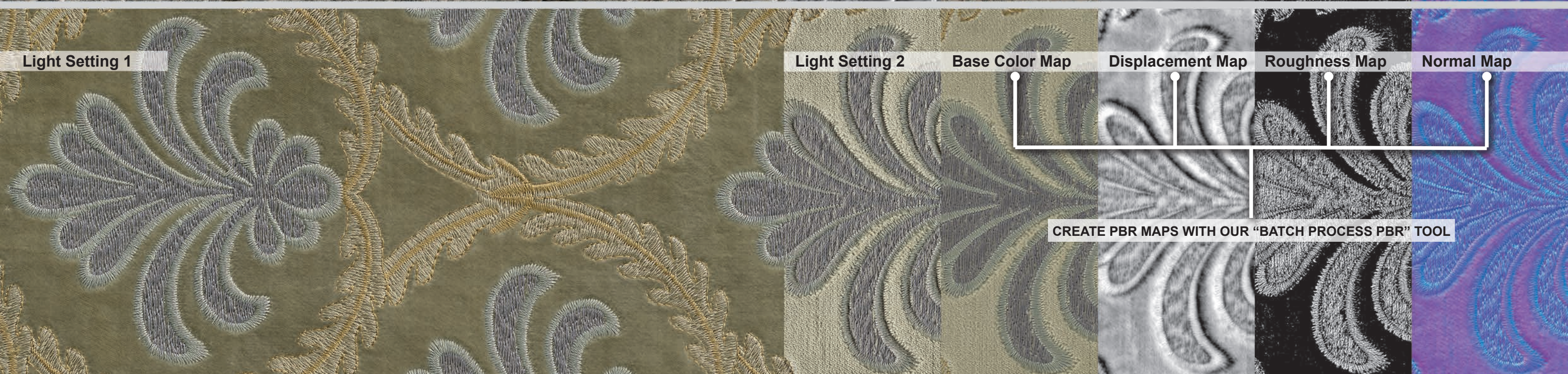
Light Setting 1

WE CHANGE THE WAY OF SCANNING - CHANGE THE LIGHT AT ANY TIME